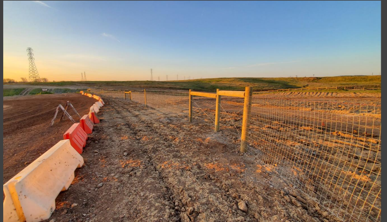
(Right) Modified peeler core fencing along the perimeter of the project area