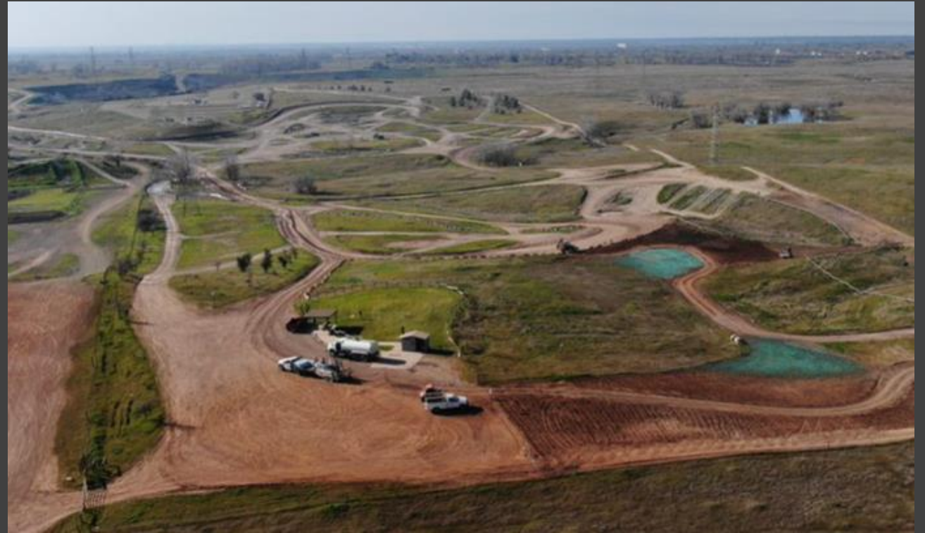
(Right) Drone image captured by OHMVRD's Todd Lewis shows earth work complete and early stages of hydroseeding in the project area