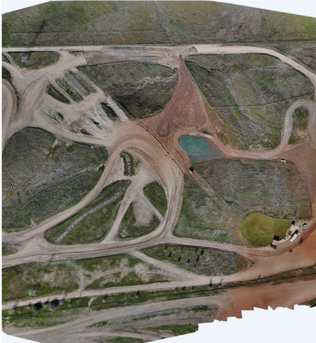
February 9, 2022