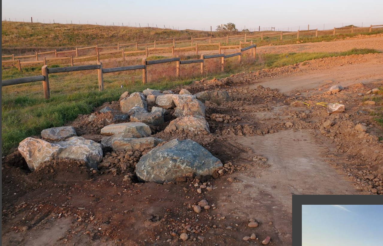
(Left) Obstacle feature on the new trail