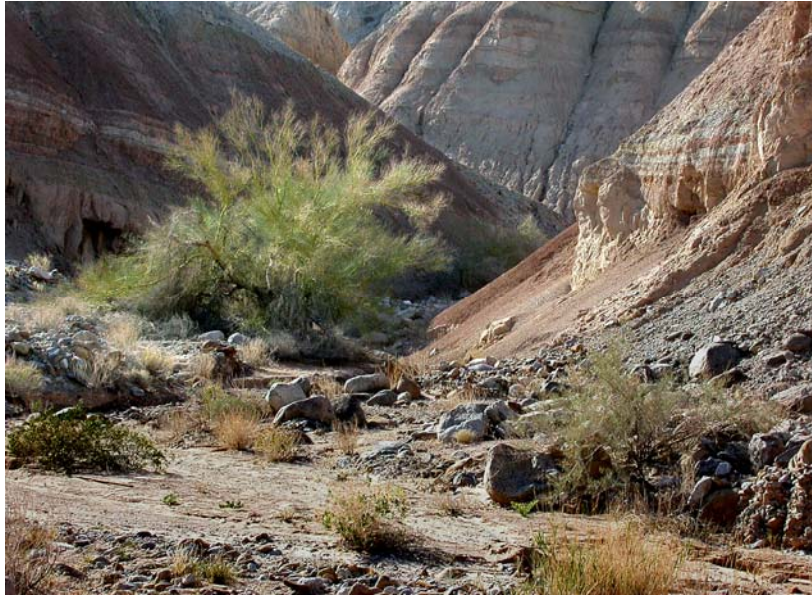
Upper Verbena Wash

The Freeman Acquisition is a checkerboard of parcels, totaling approximately 4,000 acres in northwestern Imperial County. It was acquired by California State Parks in 2006. Prior to that time, the land was owned by the Freeman Trust. State Parks is undertaking a planning effort, including a full California Environmental Quality Act analysis, to determine how best to manage these lands for the protection of the resources and other uses.