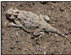
Desert Horned Lizard

When the last lake was full, Cahuilla and Kumeyaay people lived along the shore. They fished, used aquatic plants, caught waterfowl, cooked and made many types of tools. They left fire pits, trails and a variety of other features on the land. About 400 years ago the people abandoned the shore of the drying lake along with the fish traps they had built.