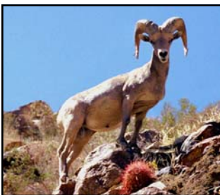
Peninsular Big Horn Sheep

Wildlife: Endangered Peninsular big-horn sheep might leave their usual mountainous habitat to forage in the Freeman Acquisition. Reptiles, birds, bats, hares and rabbits call this land their home. At least 13 rare or uncommon species of birds, including the prairie falcon and golden eagle, are known to occur here.