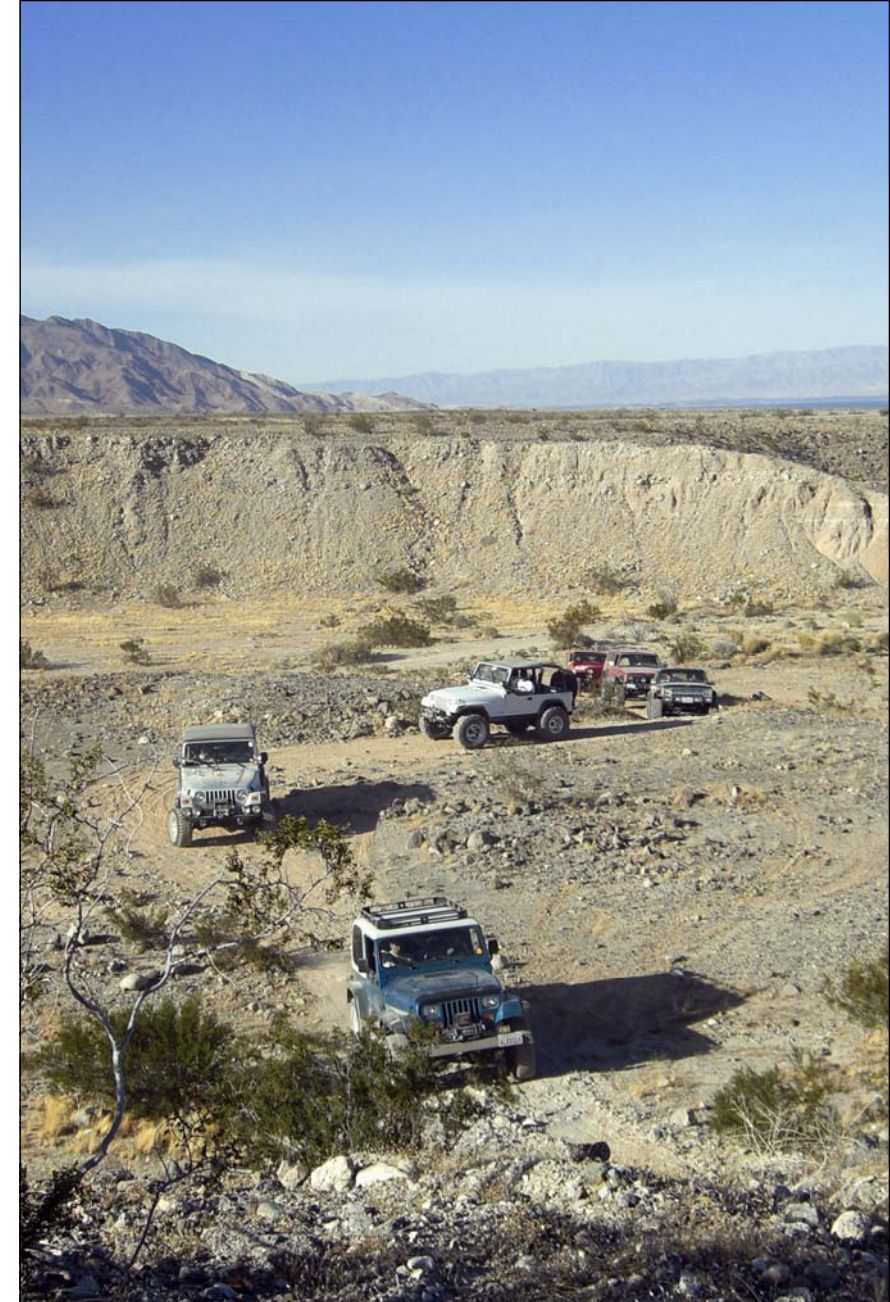
OHV Use on a Well-Established Route of Travel

State Parks is working to protect this valuable land and we need your help. To preserve delicate resources, please stay on well-established routes of travel. Traveling off established routes can damage plants, cultural resources and paleontologic and geologic sites. Irresponsible recreation can damage delicate desert land by breaking the crust of the soil or disturbing stones in desert pavement, leading to unnatural wind and water erosion and air pollution. Please respect the fragile nature of these mesas.