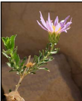
Orcutt's Woody Aster

Plants: A few protected California fan palms survive where their roots are able to reach water. Three rare plants, Orcutt's woody aster, Pierson's pincushion and Salton milkvetch, also grow here. Colorado Desert vegetation typically includes creosote bush, palo verde, brittle bush, mesquite and scattered cacti. Please avoid damaging vegetation.