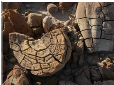
Eroded Concretions in Big Wash

Archaeology: Native American ceremonial and habitation sites include dozens of cleared circles, miles of trails and a variety of cultural artifacts. Please respect these landmarks of our state's heritage.